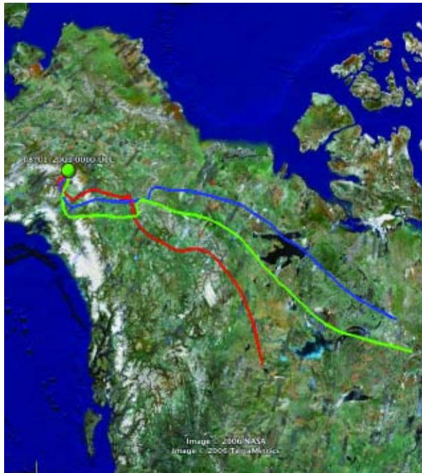
Figure 3. Hybrid Single-Particle Lagrangian Integrated Trajectory (HYSPLIT) Model predicts the movement of air parcels and is used here to illustrate the wind structure experienced by migratory birds originating at Denali National Park and Preserve. HYSPLIT analysis shown here was run directly on NOAA's Real-time Environmental Applications and Display System (READY) website. Trajectories were modeled using the FNL data set with 6-hr and 119 mi (191 km) resolution. The red, blue and green lines illustrate wind conditions at 0.3, 0.6 and 0.9 mi (500, 1000 and 1500 m) above ground level, respectively, for a 7-day period beginning August 1 2001.

Wind has a significant impact on large-scale migration patterns. Tail winds assist migrants by reducing energy consumption, increasing speed, and/or increasing potential flight ranges (Figure 2), whereas head winds have the opposite effect and may prevent migrants from flying at all. Additionally, wind exerts a direct influence on the direction of migration; for example, crosswinds may cause birds to drift off course. Wind conditions experienced by